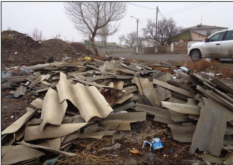
Figure 3 – Large quantities of asbestos containing roofing-sheets were observed to be dumped around the town of Shurob

During the initial scoping visit in March 2015 the presence of asbestos within the town of Shurob first became apparent. Considerable quantities of broken roofing-sheets were observed dumped at multiple locations around the town. Further, it was noted that all of the two-storey buildings selected for deconstruction all possessed the same style of roofing-sheets. Visual inspection of the material by the expert raised concerns about the potential presence of white asbestos (Chrysotile) and this was subsequently confirmed by laboratory analysis at an accredited laboratory in the UK.