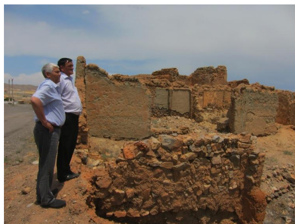
Figure 2 – Abandoned buildings in former Kyrgyz part of the town

A significant issue in Isfara District is demand for land. The Isfara river valley, where irrigated land is available, is overcrowded. This overcrowding puts pressure on local land use, leading to local conflict as well as tensions in the Tajik-Kyrgyz border areas, a source of recurrent, and at times violent, conflict. A government program exists to move families from the densely populated areas.