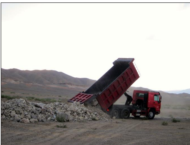
Figure 8 – Construction rubble, from which asbestos has been removed, is used to expand town flood barrier.

Before the UN team left Shurob additional meetings were held with the head of the Jamoat (municipality), who thanked UN for support provided and noted work to clear remaining asbestos and construction waste will continue. It was agreed that UNDP would monitor the activities and report back. Should work continue on track, additional follow-up activities – including the evaluation of the state of current housing by an accredited structural engineering company – will be developed and put forward for donor consideration.