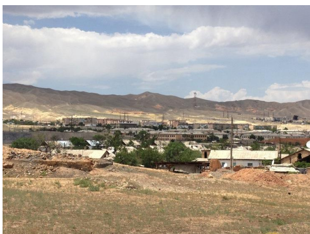
Figure 1 – Shurob town

Following the collapse of the Soviet Union as many as two thirds of the residents left, in most cases removing anything of value from houses and other infrastructure. The result is that there are a number of locations in the town which have partially deconstructed buildings and unmanaged waste from destroyed structures. In addition, a number of the remaining buildings in the town are in poor shape and posing immediate threats to neighbours and likely to collapse under minimal seismic activity. Shurob is located in a very active seismic zone.