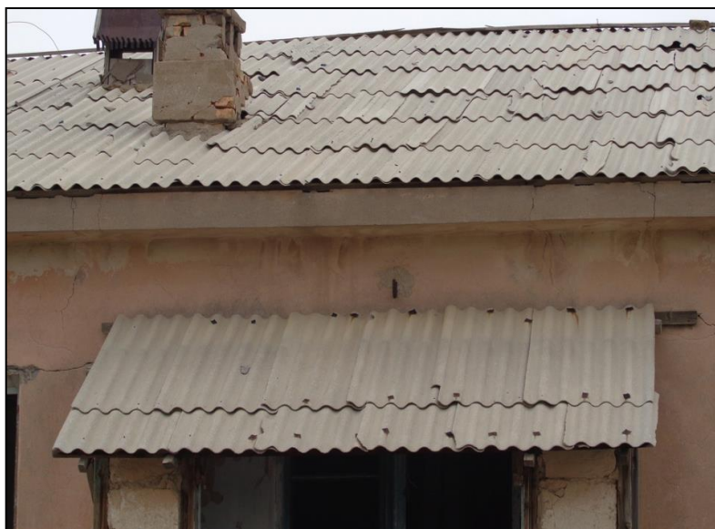
Figure 4 - it was noted that all of the two-storey buildings selected for deconstruction possessed the same style of asbestos containing roofing-sheets

Confirming the presence of a large quantity of asbestos containing roofing-sheets throughout the town of Shurob necessitated a change of approach for the proposed deconstruction plan and meant that specialist training, personal protective equipment (PPE) and specific operational procedures needed to be finalized in advance of any deconstruction activities proceeding.