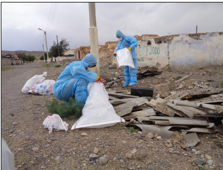
Figure 6 – Participants gained experience in the field of handling, containing and disposing of asbestos waste.

The first day of the two-day training workshop focused on occupational health and safety issues during deconstruction activities, the types and use of personal protective equipment (PPE) and waste management considerations. In the afternoon trainees participated within practical activities on the