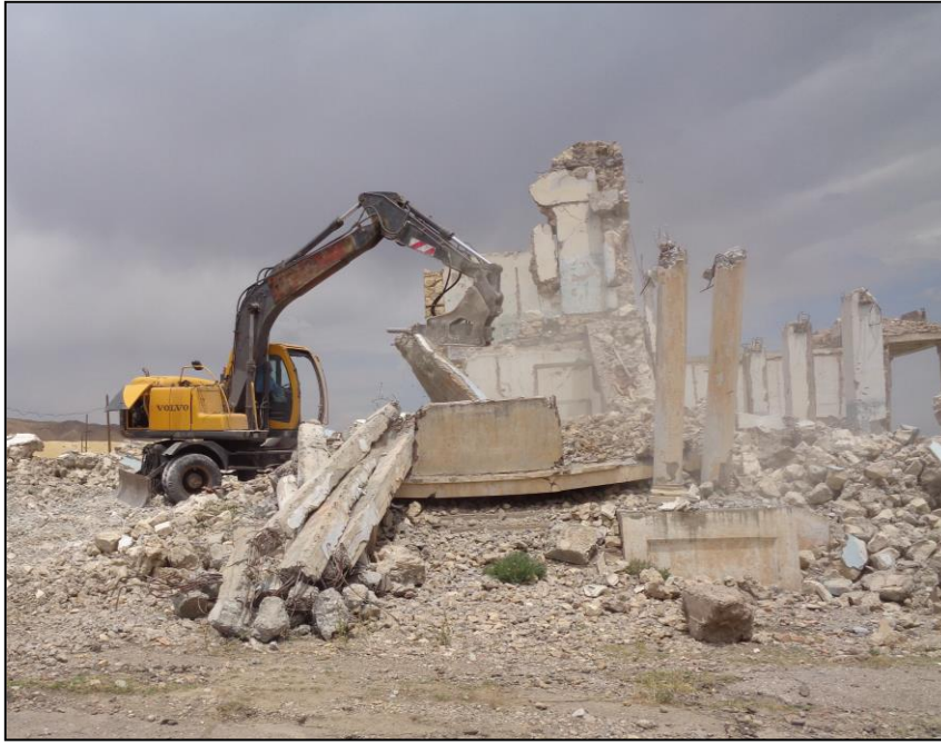
Figure 7 – heavy equipment was sourced from the adjacent mine to commence demolition works.

In total, 16 residents (5 women and 11 men) – comprising municipal workers, students, construction workers, electricians, unemployed, and housewives – took part in the training. It is encouraging to note that a third of Shurob's trained asbestos waste managers are woman.