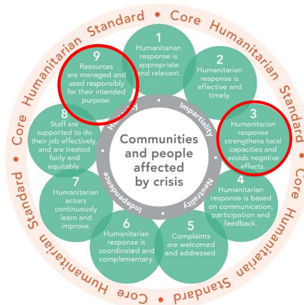
Figure 1: Diagram displaying the CHS with the commitments related to the environment highlighted.

The CHS was developed in 2014 as a way of increasing the coherence and coordination of the humanitarian sector. It came out of the Joint Standards Initiative (JSI), which brought together the Humanitarian Accountability Partnership, People in Aid, and the Sphere Standard. The JSI consultation highlighted a need for greater harmonisation between the standards, a framework that would link them together, and for affected communities to be put at the heart of the sector's response to humanitarian crises. As a result of the process, the CHS was developed to integrate and harmonise the sector's response to humanitarian crises (Core Humanitarian Standard, 2020). Since its development, the DEC has embedded the CHS into its work. Membership of the DEC requires independent verification against the CHS by the Humanitarian Quality Assurance Initiative (HQAI). This certification is an independent method of assuring organisations meet the requirements, practices and commitments set out in the CHS (HQAI, 2016). The CHS is central to the DEC's work and is a standard to which they hold their membership. Member organisations' belief that the CHS is a positive addition worth adhering to is therefore crucial.